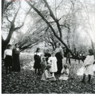
Children explore Pringle Creek with their mothers circa 1910