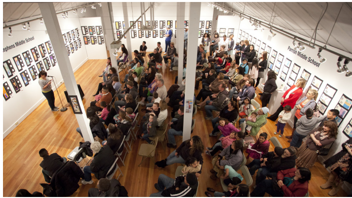
Art & Poetry Project • Adam Stephens Middle School