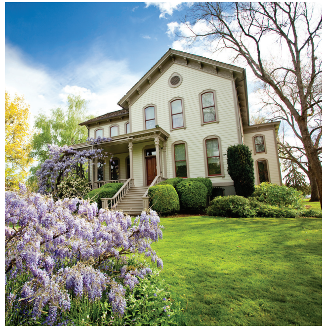
Bush House Museum