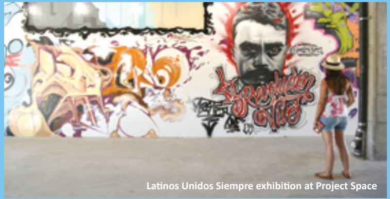
Latinos Unidos Siempre exhibition at Project Space