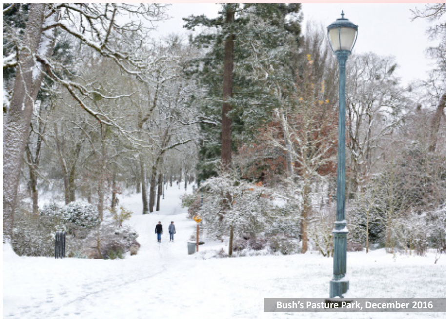
Bush's Pasture Park, December 2016

Stay connected with the Salem Art Association by following along on social media.