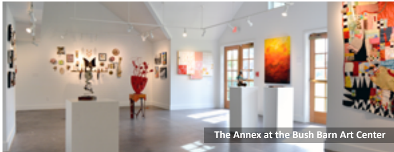
The Annex at the Bush Barn Art Center

Check online at www.SalemArt.org close to the event you're interested in for specific times and information.