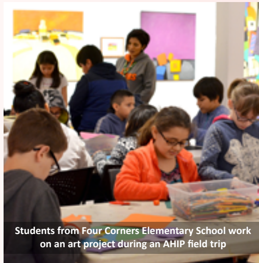
Students from Four Corners Elementary School work on an art project during an AHIP field trip

We are extremely grateful for the opportunity to partner with Trust Management Services, LLC, the Robert D. and Marcia H. Randall Charitable Trust, and the Siletz Tribal Charitable Contribution Fund. Without these three important funders, it would not be possible for SAA to deliver this high quality cultural experience.