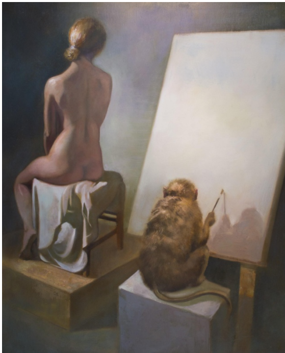
Gregory Poulin, "The Art of Painting"