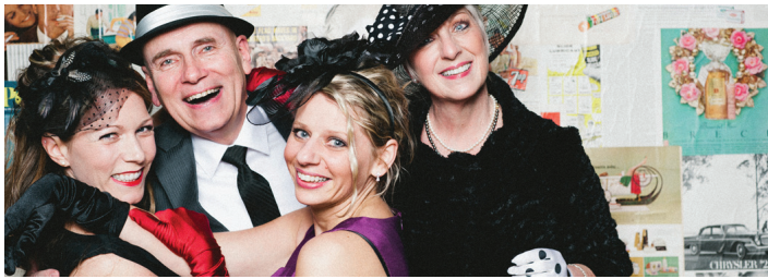
Clay Ball 2012 Hautebooth