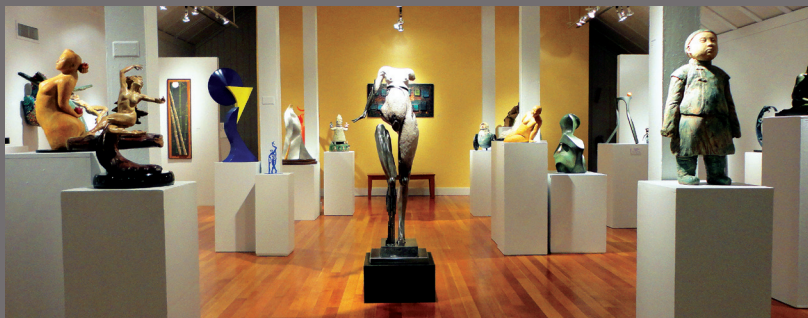
Sculptural Conversations: Works by the Pacific Northwest Sculptors

In 2012, the Galleries Program also curated four exhibitions in partnership with Community Arts Education program, as well as an exhibit marking the Centennial of women's suffrage in Oregon in partnership with the Bush House Museum. Two Art Fusion events designed to attract a wider demographic took place in January and July and emerging artist and collegiate internship programs, along with a series of professional development seminars for artists, further supported SAA's mission of keeping visual art alive and strong in our community.