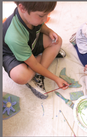
2012 AIS McKinley Mosaic

SAA's thriving Artists in the Schools program (AIS) served more than 10,000 children, teachers, artists and community members through in-school, afterschool, and workshop experiences. Additionally, SAA's High School Art Apprenticeship Program provided a year-round in-depth program for fifteen students.