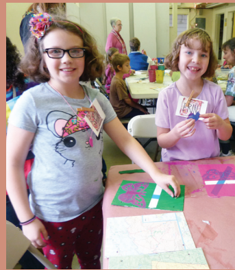
2013 Children's Art Workshop

writing collaboration. Project Space featured over 30 artists through nine exhibitions in the summer of 2013. ArtMarket provided 23 artists the opportunity to sell their work.