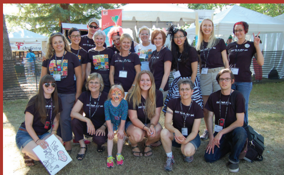
SAA staff & volunteers at the 2013 SAF&F