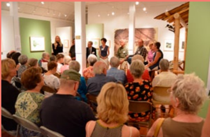
Fine Art Friday panel discussion at the Bush Barn Art Center, September 2014