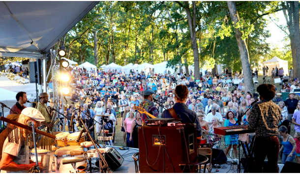
2018 SALEM ART FAIR & FESTIVAL – CALIFORNIA HONEYDROPS

FUNDRAISING EVENTS The Salem Art Fair & Festival is SAA’s largest annual fundraiser, showcasing artists from all across the nation and attracting approximately 36,000 visitors per year. The 2018 Art Fair featured 215 visual artist booths, 22 musical acts on two stages and it helped support over 50 local cultural and arts organizations. The event raised $136,657 net income to help support the year-round programs of the Salem Art Association.