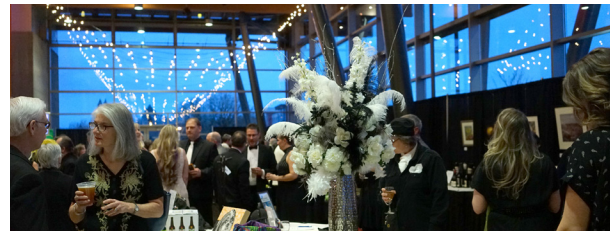
2018 CLAY BALL: SILVER SCREEN

The annual Clay Ball art auction and dinner is SAA’s second largest fundraising event and is one of the most anticipated events of the year. In 2018, due to the generosity of artists, sponsors, local businesses and art patrons Clay Ball: Silver Screen netted $26,497.