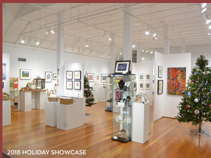
2018 HOLIDAY SHOWCASE