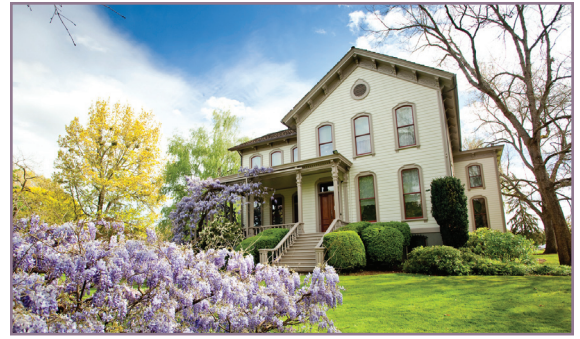
Bush House Museum