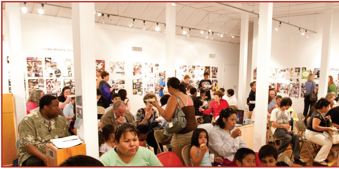
Art & Poetry Project •