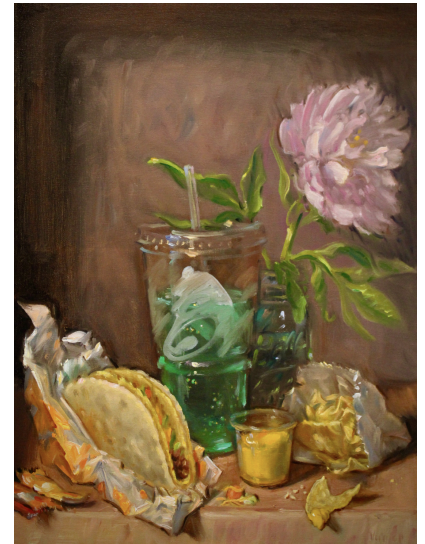
Noah Verrier, "Taco Bell" oil painting

SAA welcomes all artists making original still lifes to submit works and invites multi-media artworks, and artists and photographers who identify as immigrants, refugees, disabled, LGBTQ+, people of color, veterans and/or rural artists are strongly encouraged.